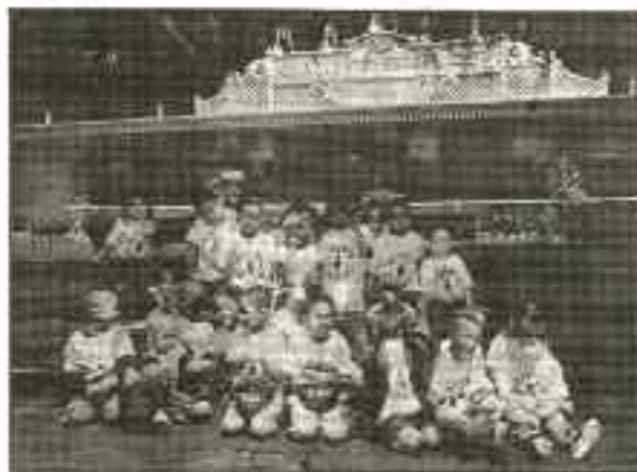
Some of the 25 terminally and chronically ill children from Denver's Hope Center at Disneyland, thanks to the Sunshine Foundation.